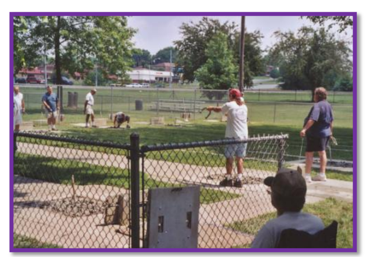
Current Elizabethtown 12-court layout

back to back clay courts with full concrete walkways. Courts 1 & 2 has full handicap accessible concrete walkways. With the new site completed, the E'town Club would host its first State Tournament in 1998. Over the years, the club continued to be on the move when it came to pitching during the winter months, pitching with portable courts in various locations including the MRC building, the ambulance building and the Lincoln Mercury building. Around 1988 or 89, the club began pitching in "The Barn", located on property owned by Lou Pottinger. "The Barn" had three courts insulated and heated by a gas burner. It also included restrooms, a bar and a lounge area. The courts were located on the upper level of the barn on a tongue