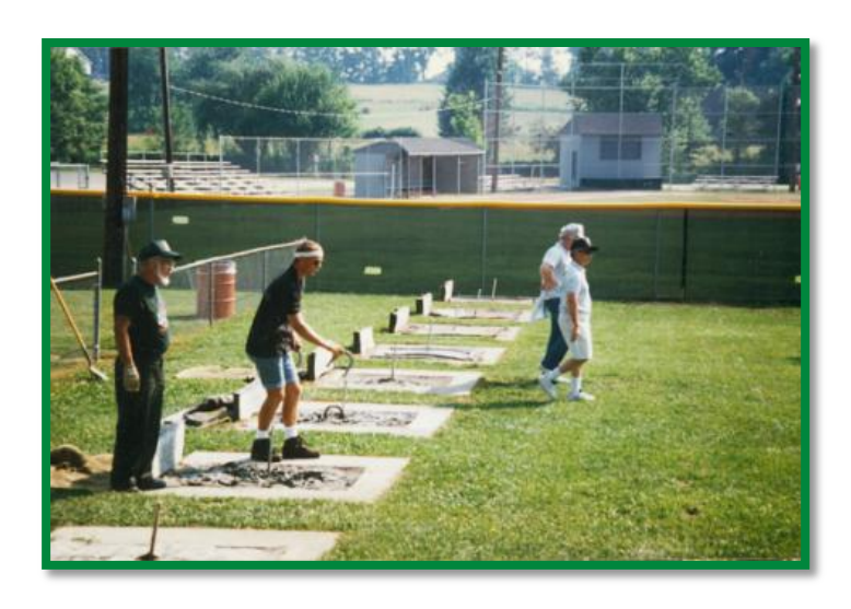
Original Elizabethtown 8-court layout

court layout would remain a constant on the KHPA schedule through the 1997 season. During this time the club wished to move the location of its current set of courts due to the close proximity to the parks youth baseball fields. The courts were deemed unsafe, as balls were frequently being hit onto the court site with the youth running after them. Lou Pottinger stated that a ball once hit Omar Blacketer in the heel during a horseshoe event and it had a lingering effect on Omar's pitching the rest of the year. (You can see the baseball fields in the background of the photo to the left.) The E'town Club evolved over the years in its membership from the 80's through to when the new courts were built